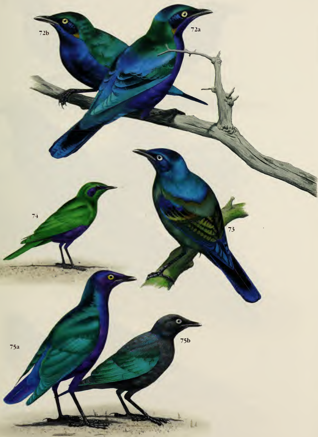
Plate 2. 72: Splendid Glossy Starling Lamprotornis splendidus ( a = adult male, b = adult female). 73: Principe Glossy Starling Lamprotornis ornatus . 74: Emerald Starling Lamprotornis iris . 75: Purple Glossy Starling Lamprotornis purpureus ( a = adult, b = juvenile).